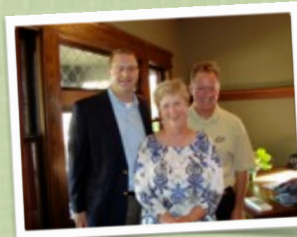
City, State, and Community Representatives