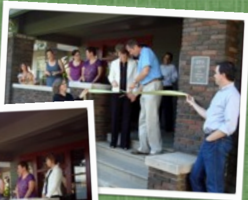
Ribbon Cutting Ceremony October 7, 2011 ...continued on page 3