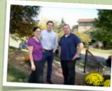
Members of the Purdue History Department