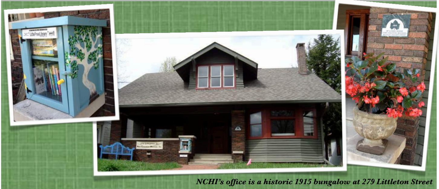
NCHI's office is a historic 1915 bungalow at 279 Littleton Street